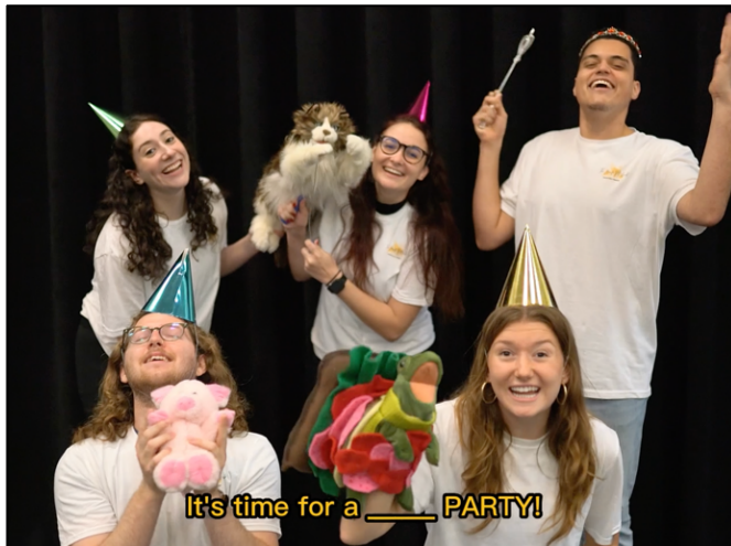
Clockwise from top left: UCF student facilitates creative drama activity during a bedside visit; still image from digital component of scavenger hunt; patient at Nemours unlocks tea party activity box after completing scavenger hunt asynchronously; students present a “The Party Song” as part of the post-show activities.

The scavenger hunt, virtual workshops, and bedside visits have all given our patients opportunities to do something fun and interactive that helped normalize the hospital for them. We are so grateful and look forward to continuing to work with JMG in the future.