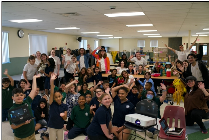
Clockwise from top left: UCF students in front of the green screen at The Seacrest Studio (Arnold Palmer) after their live-streamed performance; engaging patients in an interactive dance; an actor during our filmed performance; UCF students and children at UCP Bailes Community Academy Charter School.

“During the performance there was a little boy that came to watch in person. When the audience participation moments happened, he got so excited. He was completely captivated by the performance and his face lit up every time he got to participate. For the hour or so of the performance he was mesmerized. I don’t think I saw his eyes leave the performance once. I think the impact these performances can have on patient outcomes are profound. ”